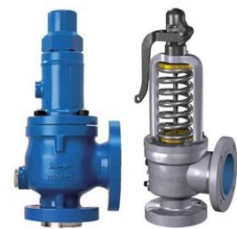
Pressure & Safety Relief Valves