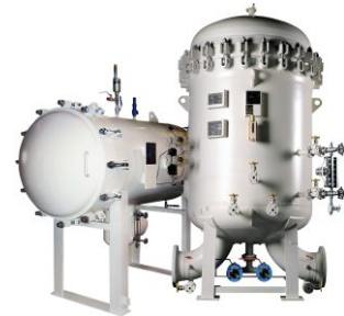
Filters / Separators