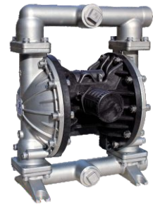
Double Diaphragm Pumps