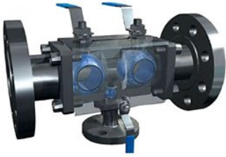
Double Block and Bleed (DBB) Valves