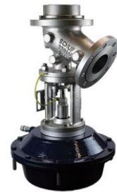
Bottom Tank Valves