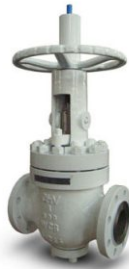
Rising Stem DBB Plug Valves