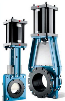
Knife Gate Valves