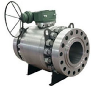
Ball Valves Manual & Actuated